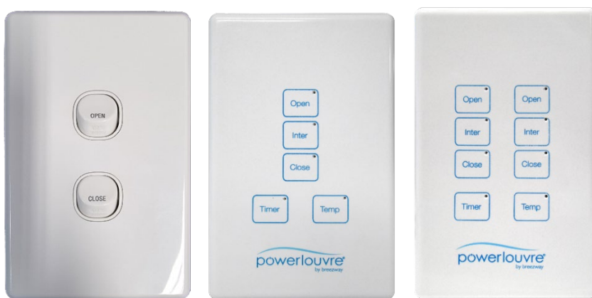
Examples of bell-press switch and previous Apptivate Control Unit Models

Low voltage 24V DC current. DO NOT USE HIGH VOLTAGE - MAX 29V LIMIT.